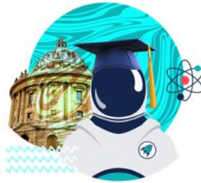
University Subject Tasters