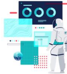
Apprenticeship/ University Search & Advice

The subject spotlight series are created by universities to showcase what it is actually like to study certain subjects at degree level.