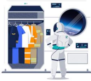
Virtual Work Experience

Aimed at years 9-13, we subscribe to the "Ignite" hub which allows students to sign up for interactive virtual work experience and gain insight into different university courses. Students have been emailed log-in details so they can access this from home or in school.