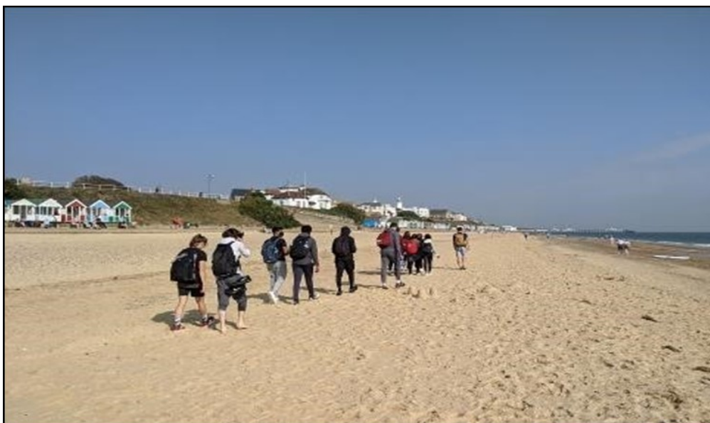
Photo: Geography field trip to South world