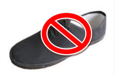
No trainer-style school shoes are permitted