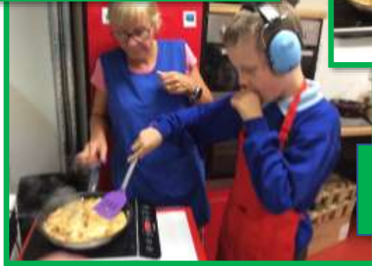
Making Spanish omelette