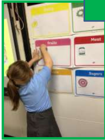
Sorting products into foods groups