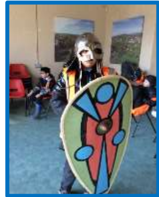
Role-plays and dressing-up