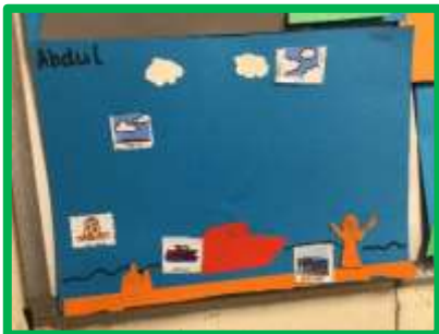
Designing story settings