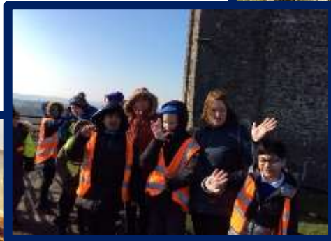
Clitheroe Castle trip