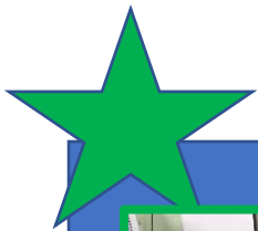
Body awareness work