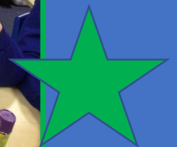
Transition work – our new uniforms