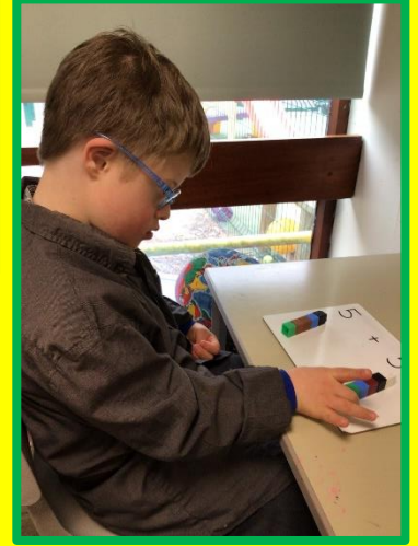
Working hard on our maths