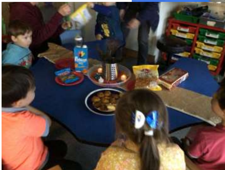
We enjoyed our Diwali celebrations. We made crafts, danced to music and sampled food.