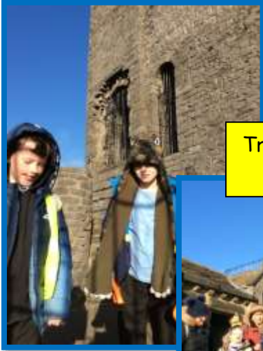
Trip to Clitheroe Castle