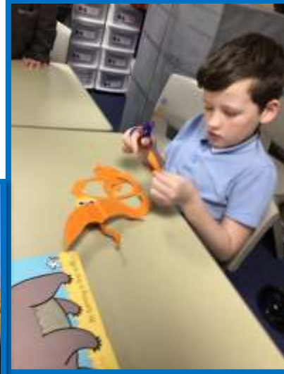
Making dragon models