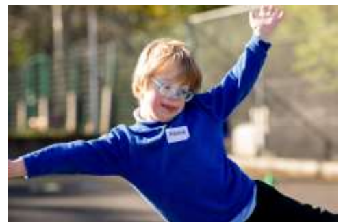
For super dancing