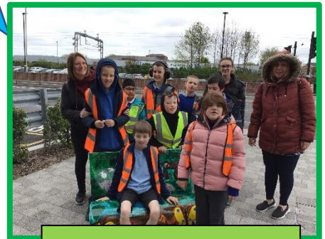
'Book Bench' trail in Chorley.