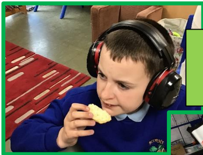
Celebrating St George's Day – the scones were great!