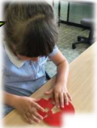
Some of the children had fun doing some role play with our class story this week!