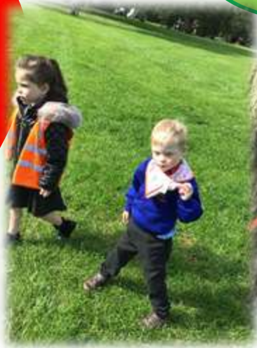
Geography on the Park!

Well, what a lovely, energetic fun filled week we've had! The children are really enjoying each others company