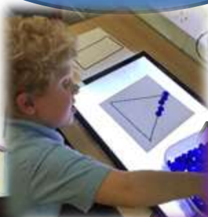
All about shapes!!