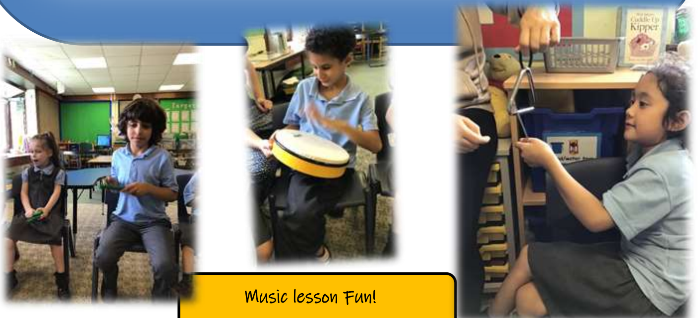
Music lesson Fun!