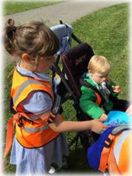
Colour Nature Hunt on the welly walk

This week we have enjoyed lots of activities around our theme - minibeasts. We had music, bug hunts, art and craft - snails and in our Attention Autism we created a giant snail! We even made snail cakes. We listened to the story "Norman the slug with the silly shell"