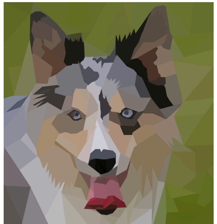
Photoshop skills by Holly (Year 7)