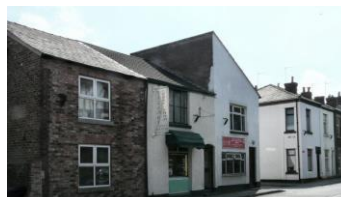
10) Village cake shop