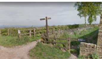
5) Outside Werneth Low Golf Club