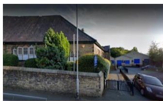
2) Holy Trinity