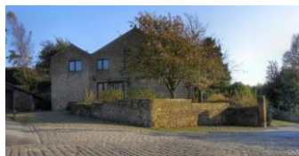
3) Werneth Low Visitors Centre