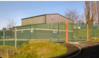
4) 3 rd Gee Cross scouts