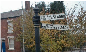
5) Gee Cross signpost (Tesco)