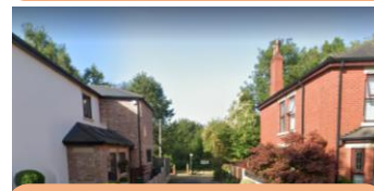
12) Stockport Road entrance to Gower Hey Woods