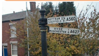
11) Gee Cross signpost (Tesco)