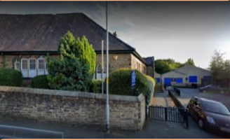
3) Holy Trinity