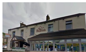
12) The Buxton