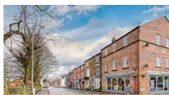
8) On The Move