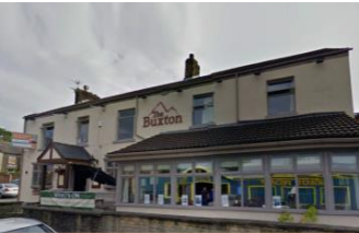
2) The Buxton