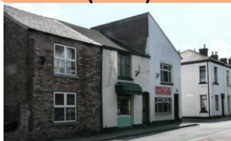
6) Village cake shop