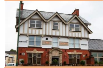
8) The Grapes