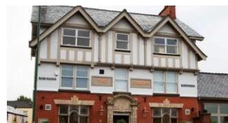
7) The Grapes