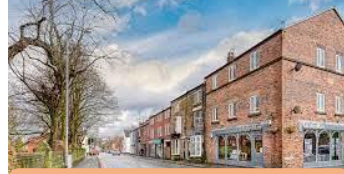
7) On The Move