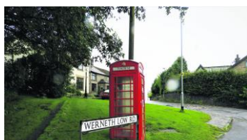
6) Werneth Low Golf Club