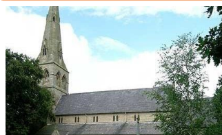
9) Hyde Chapel School Lane gate