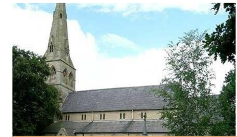
10) Hyde Chapel School Lane gate