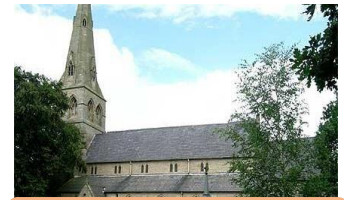
9) Hyde Chapel Knott Lane gate