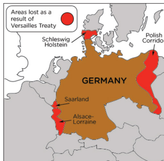
Map of Versailles Treaty

The terms of the treaty came not only as a shock but also as a huge blow to German expectations. Many had expected that, by removing the Kaiser and setting up a modern democratic government, Germany would be treated fairly and leniently by the Allies. A wave of protest followed the publication of the terms of the treaty. The army commanders made it clear to the government that further military operations would be a disaster and there was no choice but to accept the terms of the treaty. The majority of Germans felt bitter resentment at the terms and the new government was widely criticised for agreeing to them. The republic had got off to the worst possible start. Many Germans believed that they had been ' stabbed in the back ' by politicians who signed the unpopular treaty.