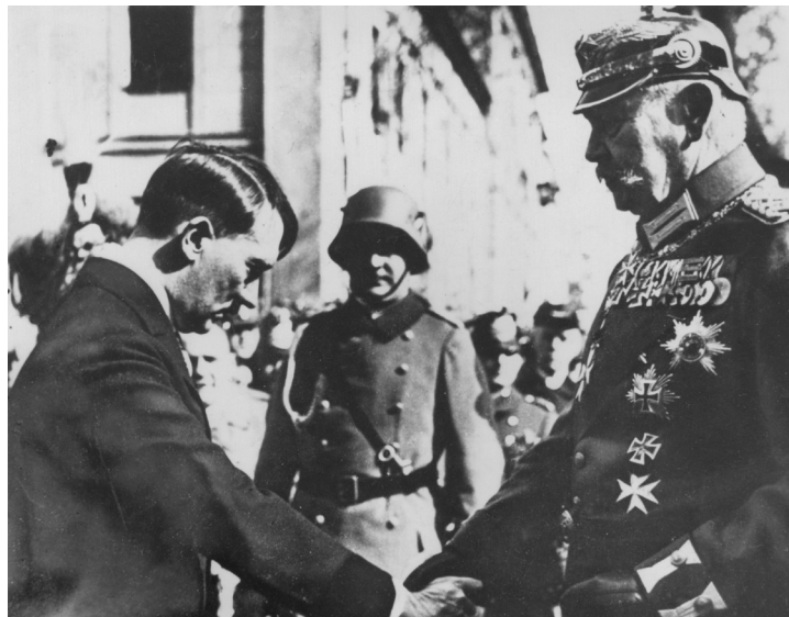
Hitler bows to Reich President von Hindenburg

President Hindenburg decided in this crisis situation that under Article 48 of the constitution, the Brüning government could rule by emergency decree as it had no majority and the economic situation was serious. This was deeply unpopular and showed that Germany was no longer a true democracy.