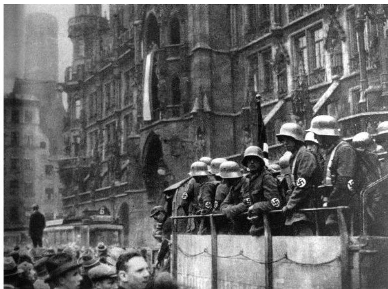
Source 3 - Nazi Stormtroopers outside Munich City Hall

Hitler was supported by General Ludendorff, one of Germany's war heroes, and on 8 th November 1923 Hitler and the SA surprised a meeting of the Bavarian government in Munich by striding into the meeting, firing a pistol into the ceiling and bullying the Bavarian leaders into joining what Hitler called 'a national revolution'. The attempted Munich Putsch quickly lost support and a march headed by Hitler and Ludendorff was fired on by police: 16 people were killed. Hitler and Ludendorff were put on trial for treason. The trial was an opportunity for Hitler to make himself well known throughout Germany. The trial proved to be a superb propaganda platform for Hitler. In the end Ludendorff was acquitted and Hitler was given the comparatively light sentence of 5 years' imprisonment. In Landsberg prison, Hitler used the opportunity to write his book Mein Kampf (My Struggle) which set out his main ideas. His good behaviour in prison persuaded the Bavarian government to release him after only nine months. He now had to rethink his strategy to gain power; he realised after the experience in Munich he could not just rely on violence to obtain it.