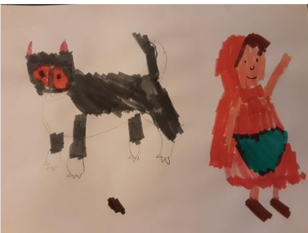
Alfie—Little Red Riding Hood