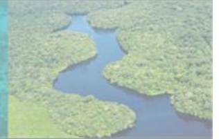
Amazon Rainforest, Brazil