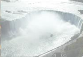
Niagara Falls, Ontario/New York