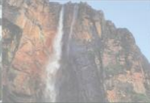
Angel Falls, Venezuela