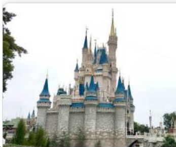
Walt Disney World