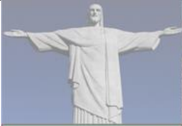
Christ the Redeemer, Brazil