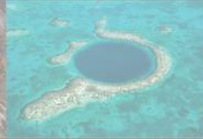
Great Blue Hole, Belize