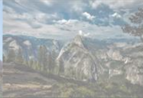
Yosemite Valley, California