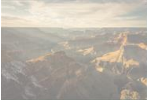
Grand Canyon, Arizona