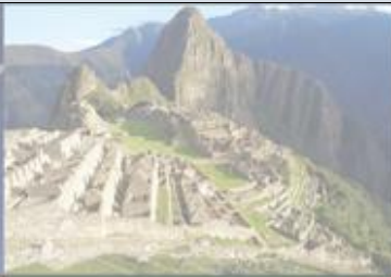
Machu Picchu, Peru