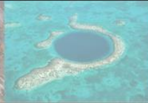
Great Blue Hole, Belize