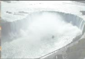
Niagara Falls, Ontario/New York