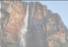
Angel Falls, Venezuela