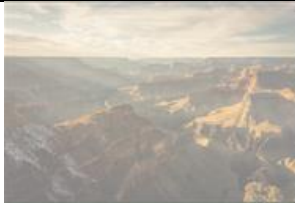
Grand Canyon, Arizona