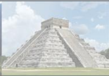
Chichen Itza, Mexico