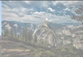
Yosemite Valley, California