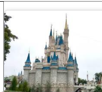
Walt Disney World