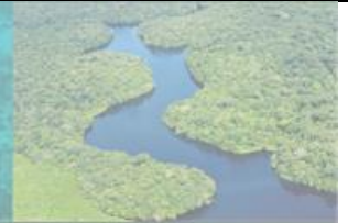
Amazon Rainforest, Brazil