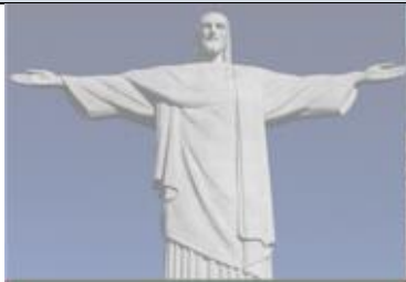
Christ the Redeemer, Brazil