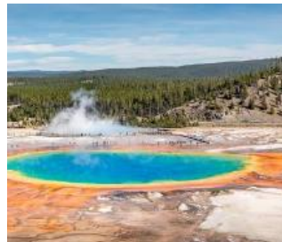
Yellowstone National Park