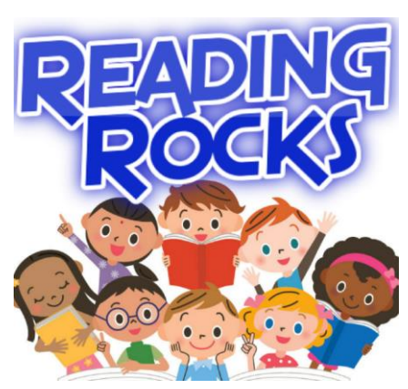
A huge thank to everyone who attended our very first 'Rock up and Read' session!