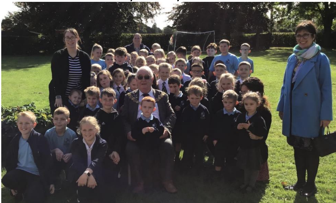
Mayor and Mayoress Visit