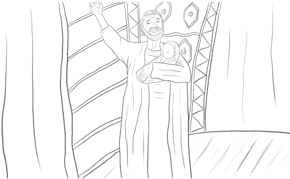
God shares his loving plan with Zechariah.

On the birth of his son, John the Baptist, Zechariah's lips are opened, and he sings a song of praise to God.