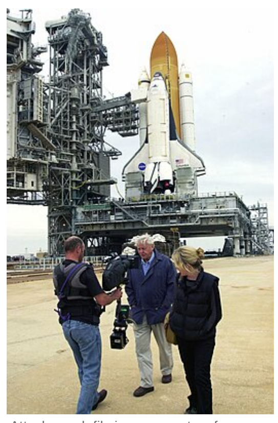
Attenborough filming commentary for a documentary at the Kennedy Space Center in Florida, with a Space Shuttle in the background