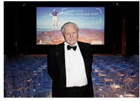
Attenborough at a screening of <u>Great</u> Barrier Reef, 2015

In October 2014, the corporation announced a trio of new one-off Attenborough documentaries as part of a raft of new natural history programmes. "Attenborough's Paradise Birds" and "Attenborough's Big Birds" was shown on BBC Two and "Waking Giants", which follows the discovery of giant dinosaur bones in South America, aired on BBC One. The BBC also commissioned Atlantic Productions to make a three-part, Attenborough-fronted series Great Barrier Reef in 2015. The series marked the 10th project for Attenborough and Atlantic, and saw him returning to a location he first filmed at in 1957. [70][71]