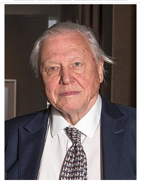
Attenborough at the opening of the Weston Library in March 2015

OM GCMG CH CVO CBE FRS FSA FRSA FLS FZS FRSGS FRSB