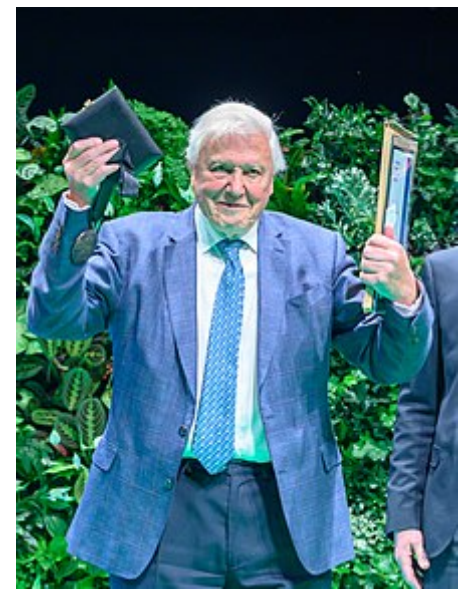
Attenborough receiving the <u>Landscape Institute</u> Medal for Lifetime Achievement, and becoming an Honorary Fellow of the Landscape Institute in 2019