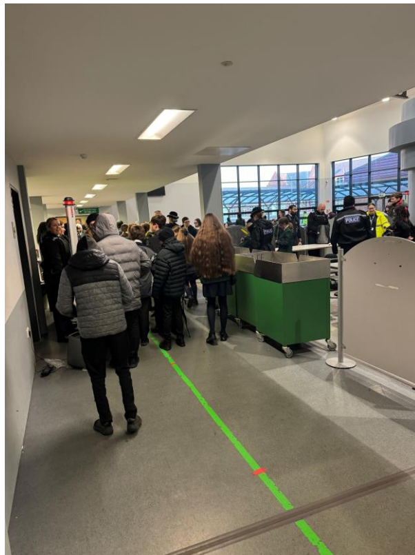
20 - Knife Arch- ALSOP