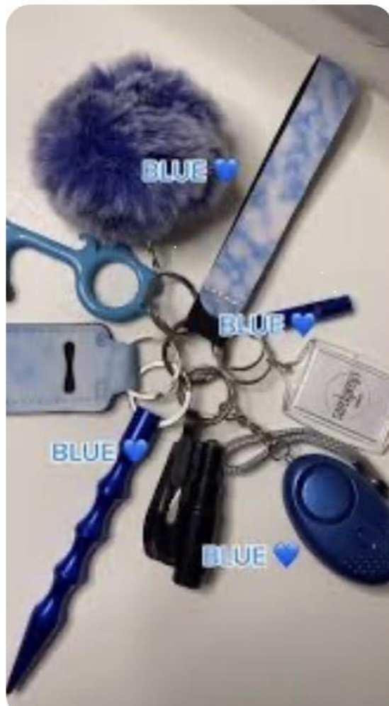
3 - Self defence lanyard

Nitrous oxide ban: guidance - GOV.UK (www.gov.uk)