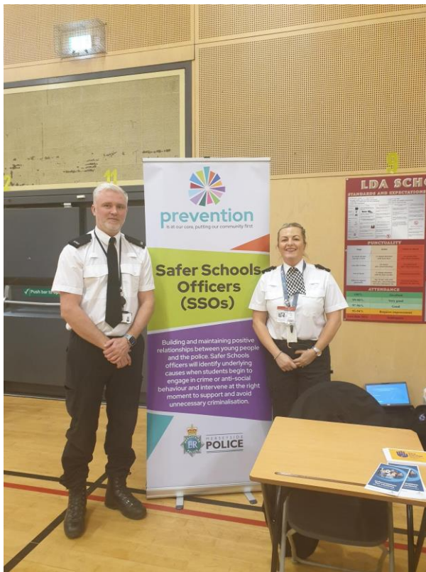
21 - PC Simon & PC Jo-

We spoke to all year groups about different roles within the police at Lord Derby Academy . This included engagement with Year 7 and 8 allowing them to try on body armour and high vis coats.