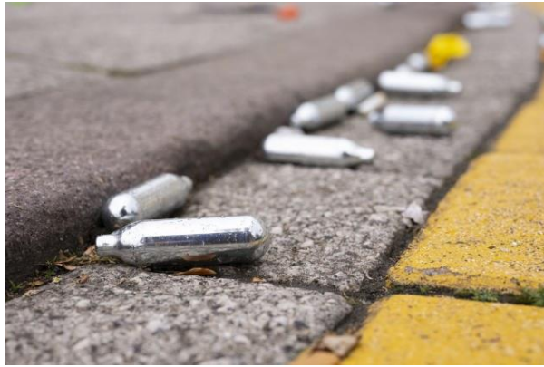
2 - Nitrous Oxide Ban

Nitrous oxide is a colourless gas, also known as 'laughing gas'. It can be misused for its psychoactive effects – or to 'get a high' – by inhalation.