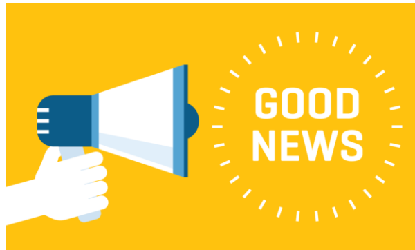
4 - Good news!

Attached is a 'self defence lanyard' being sold on Tik Tok and other online platforms. It is essentially encouraging young people to be equipped with the tools to protect themselves and some even have concealed blades in the key ring.