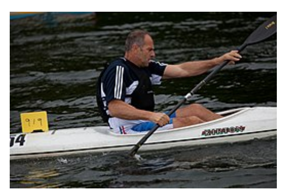
Redgrave in 2011