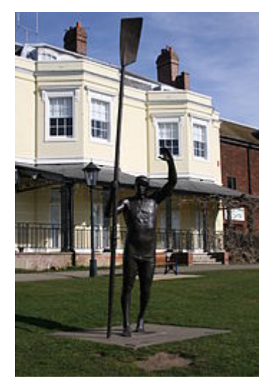
Statue of Redgrave in Higginson Park, Marlow