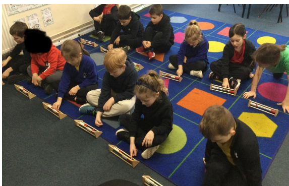
Maths with Rekenreks!