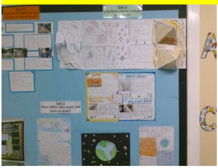
During Science Week, all the classes have been looking at change and adaption.

Please remember to keep the school office informed of any changes to your contact details, we rely on you keeping us up to date in case we need to contact you in an emergency, or if your child is taken ill.