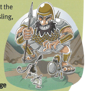
Bible story based on 1 Samuel 17

This was a day no-one would forget, when the courage of a shepherd boy saved a nation.