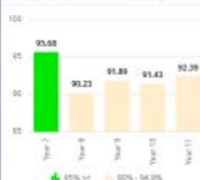
Average Attendance % for each Year Group

The end of the first full term is only a week away. We have a lot of very excited students looking forward to next week's activities, most notably the rewards trip on Thursday. Well done to all those who qualified for this! Don't worry if your child didn't, there are many more rewards coming throughout the year that they can aim to pick up, so encourage them to be in school every day going forward.