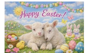
Bubble & Squeak in their first photo shoot

This week, our pupils were treated to some very special visitors — ‘Bubble and Squeak’, a pair of lively spring lambs who spent the day in school as part of our learning activities. Their arrival created a wonderful buzz, giving pupils the chance to see the animals up close and learn more about how they are cared for.