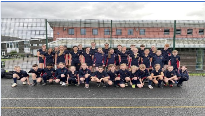
Archbishop Temple runners 2024

All of the secondary schools in Preston sent runners to take part and the event was a resounding success.