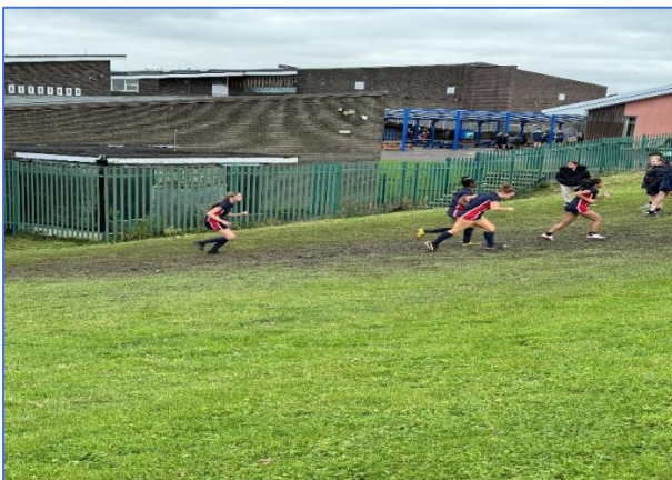
Senior Girls runners