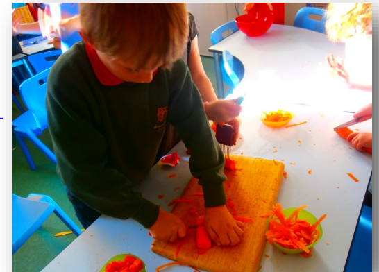
Healthy Living Club