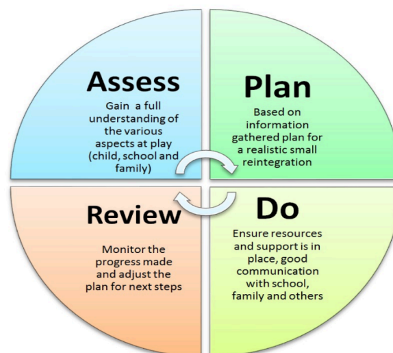
Figure 2: Assess, Plan, Do and Review Cycle (APDR)

At Armfield Academy we follow the Assess-Plan-Do Review cycle to monitor the impact of interventions, helping our staff to develop a growing understanding of pupil’s needs and effective ways to support pupils with SEND.