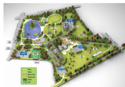
LAYOUT PLAN OF ARNOT HILL PARK