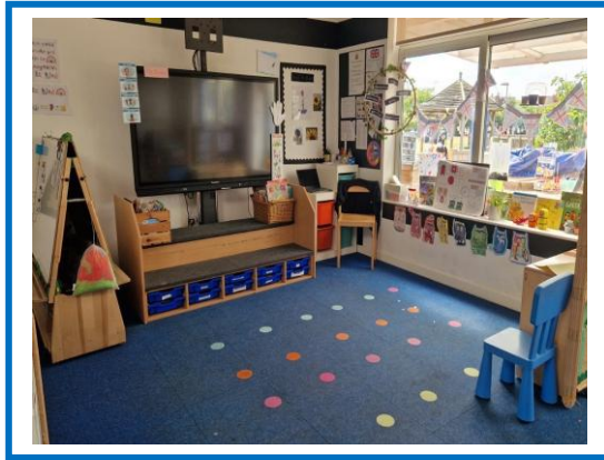
This is your carpet area