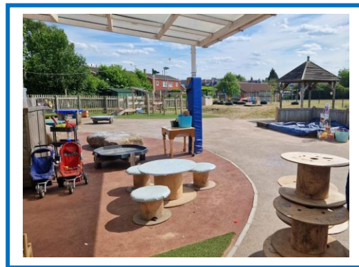
This is the outdoor area