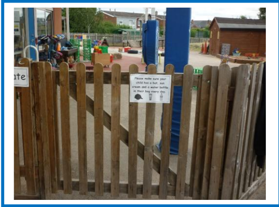
This is the gate you will use to get to your classroom.