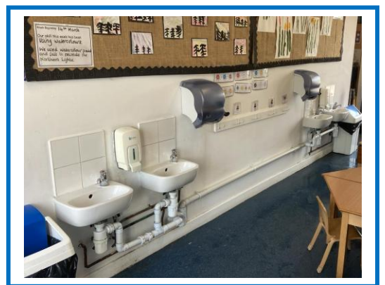
This is where you will go to use the toilet and wash your hands.