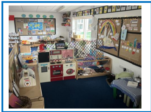
This is your classroom