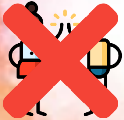
Giving high fives