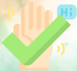
Wave to each other