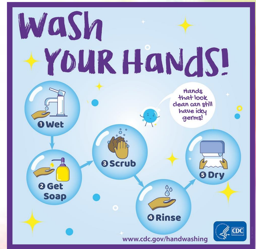
Washing our hands regularly.