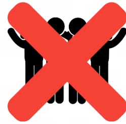
Being really close to other people