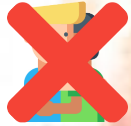
Hugging our friends