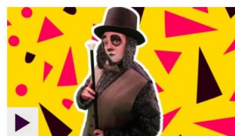
The 5 Times Table

Chelsea mascot Bridget the Lioness, has a song and movement routine to help students learn their 2 times table.