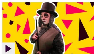
The 5 Times Table

Chelsea mascot Bridget the Lioness, has a song and movement routine to help students learn their 2 times table.