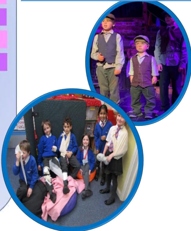
The Little school with a big heart

The school has a behaviour charter which is displayed in every classroom. Our School Charter (RRS)* Ready to learn Respectful of everyone Safe in our behaviour