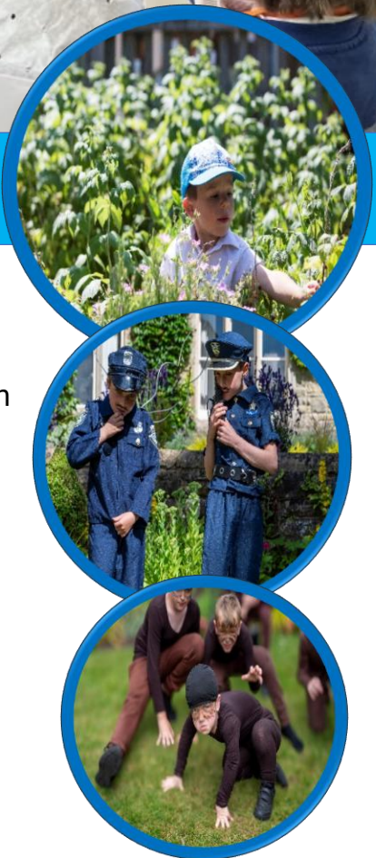
The Little school with a big heart