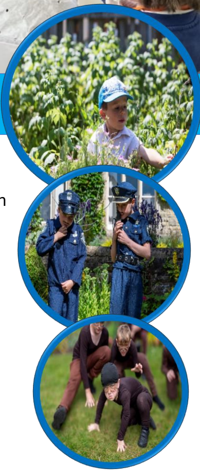
The Little school with a big heart

In KS1 the delivery of these subjects is through continuous provision.