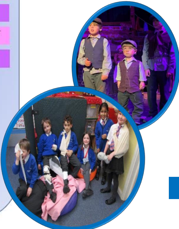
The Little school with a big heart