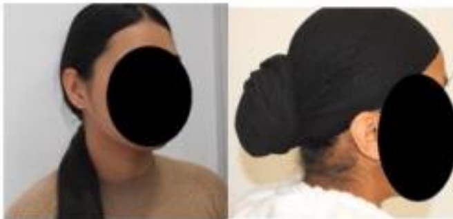
Hair tied back with stud earrings Blue (navy) or black Patka