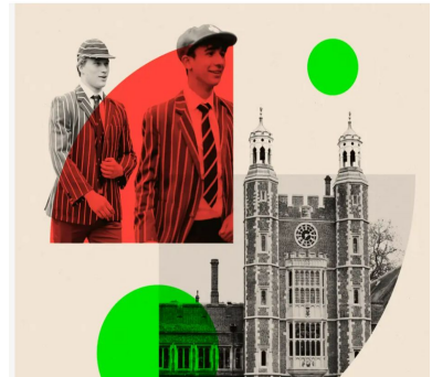
The debate: Would Labour's plan to tax private school fees work? - BBC News