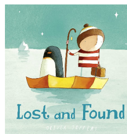
Lost and Found By Oliver Jeffers