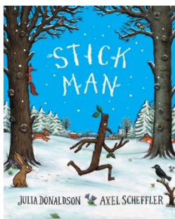
Stick Man By Julia Donaldson