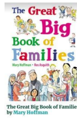
The Great Big Book of Families