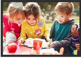
Book Lists - All About Me