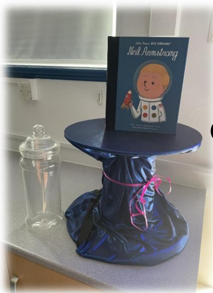
Our 'Neil Armstrong' Provision Room for support and intervention at every level for all children who need it.