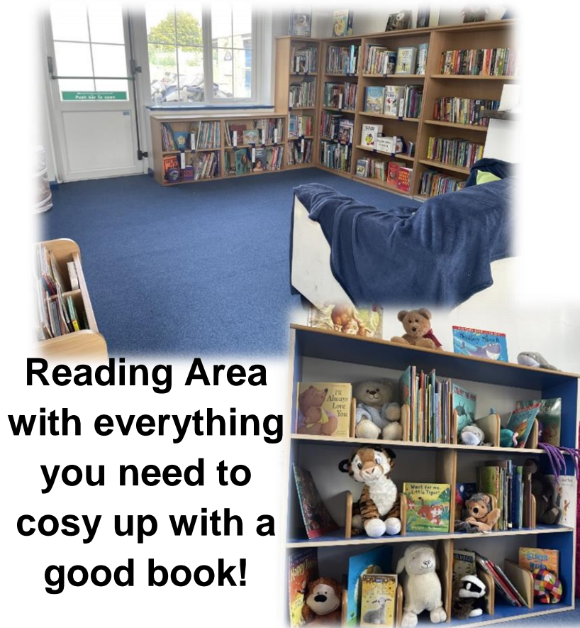
Reading Area with everything you need to cosy up with a good book!