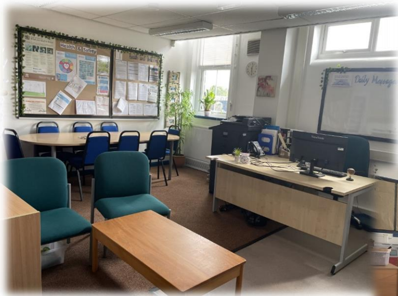
New collaborative workspace for staff, visitors and families.