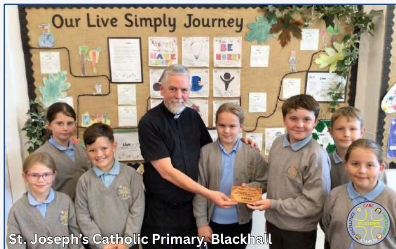
St. Joseph's Catholic Primary, Blackhall

As part of our pledge for our Trust to be more sustainable we are delighted that four of our schools have already achieved the award – well done Our Lady of Lourdes Catholic Primary, Shotton, SS Peter & Paul Catholic Primary, South Shields, St. James Catholic Primary, Hebburn and St. Joseph's Catholic Primary, Blackhall.