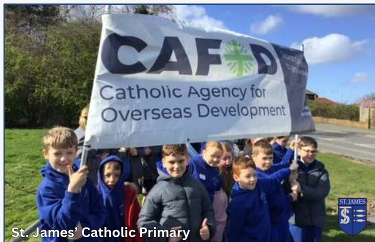
St. James' Catholic Primary