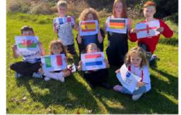
Pupils of St James' Catholic Primary School, Hebburn