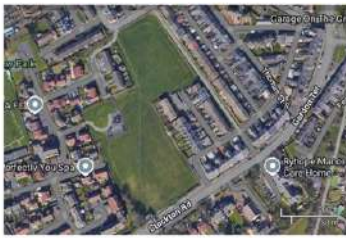
Proposed site for new replacement St Patrick's Catholic Primary School in Ryburn.

It is understood that the development is part of the Government's School Rebuilding Programme £1 and will see a new replacement school for St Patrick's Catholic Primary School, which is currently based nearby at Smith Street.