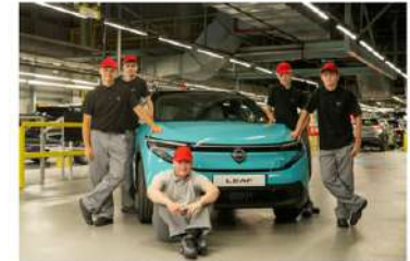
The three apprentices who have graduated from the Nissan Skills Academy and will now begin working on the manufacturing plant.

The group of 12 students studied the Level Two Engineering programme at Sunderland College's City Campus, with technical manufacturing skills tuition from the college and Nissan teaching teams.