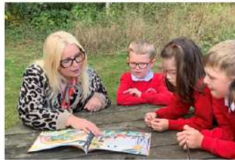
Teach First BCCET SCITT

"Because I was already volunteering with a BCCET school, it felt natural to do my teacher training with the Trust. I'm feeling very nervous and excited. My first impressions of the programme have been brilliant; it is so well organised. Even though I knew the teachers at the school, I didn't know many other people at the Trust, but everybody has been lovely."