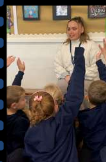
▶ Meet Daria