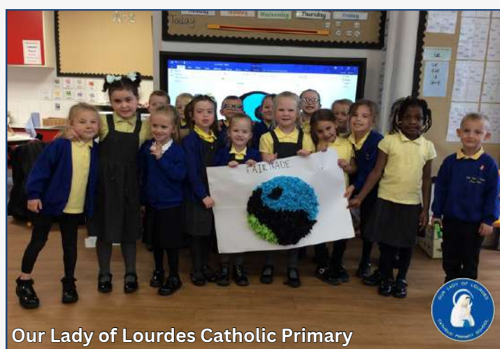
Our Lady of Lourdes Catholic Primary

Live Simply supports Pope Francis's call to action in his encyclical Laudato Si' , which focuses on protecting the environment. The Laudato Si' Action Platform was launched to inspire and encourage the global Catholic Church to reflect on their part in the care of God's creation and love of their neighbour, over a seven-year journey.