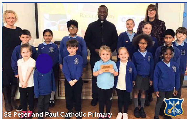
SS Peter and Paul Catholic Primary

Schools have involved themselves in a wide-range of activities including; reducing waste in school, organising preloved uniform shops, building bug houses, fundraising for CAFOD's World Gifts, making Live Simply pledges, saving energy and living more sustainably.