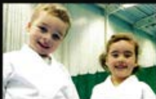
Martial Arts for all Abilities from Age 4+

Bromsgrove Leisure Centre Saturday 08:30 - 09:30 Kings Heath Tue 19:00 - 20:00 Sun 12:00 - 14:00 Ardenhith Castle Park Recreation Centre Sunday 10:00 - 12:00 Solihull Taylor Group Leisure Centre Friday 18:00 - 19:00 Sunday 14:00 - 16:00 Haybridge School Monday 19:00 - 20:00 Tamworth Leisure Parks Academy Friday 19:00 - 20:00 Stratford (Open Access) Leisure Centre Friday 19:30 - 20:00 Sharncliffe Crystal Leisure Centre Saturday 10:15 - 11:15 Village Hall Solihull Saturday 10:00 - 11:00