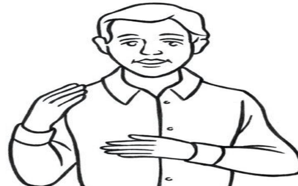
4. Touch your right shoulder and pray, "Spirit, Amen."