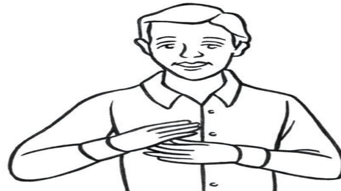
2. Touch the center of your chest and pray, "and of The Son,"