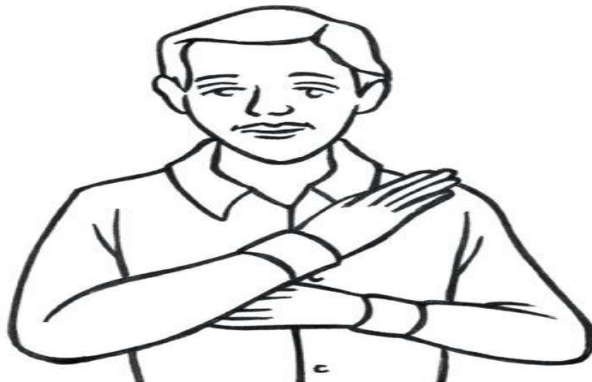
3. Touch your left shoulder and pray, "and of The Holy..."