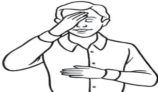
1. With your right hand, touch your forehead and pray, "In the name of The Father."