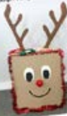
Rudolph Ring Toss Game