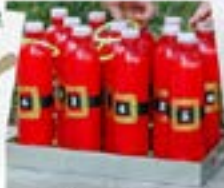
Santa ring toss game