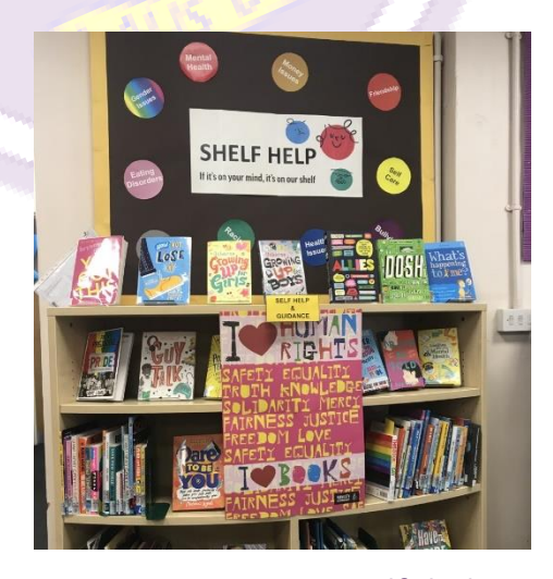
SHELF HELP – Our new self help section includes a collection of books designed to answers questions our young people may have. Subjects covered include friendships, families, money advice and mental health and wellbeing.