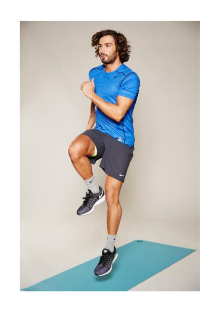
1. High Knees -bring your knees as high up to your chest as quick as possible.

Hard- Work at a high intensity for 40 seconds and rest for 20 seconds.