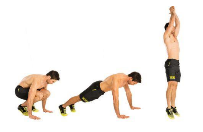
3. Burpees – begin in a standing position, then bend into a squat with your hands on the floor. Kick your feet out and then back in again.