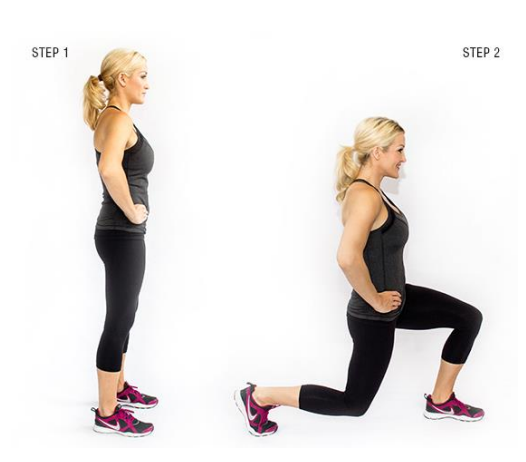
4. Lunges- Start in the standing position and then bend with one leg in front of the other. Make sure that your knee does not go past your toes. Make it more difficult by adding 2 weights.