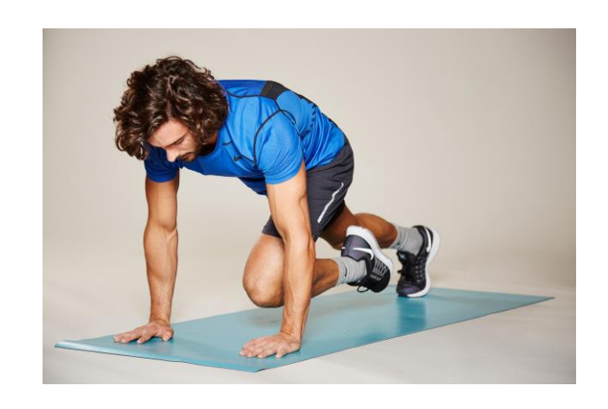
2. Mountain Climbers- get onto the floor in a press-up position and bring your knees to your chest as quick as possible. Your feet can touch the floor under your chest.