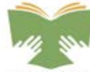
Foundation 3 Professional Learning Staff Development